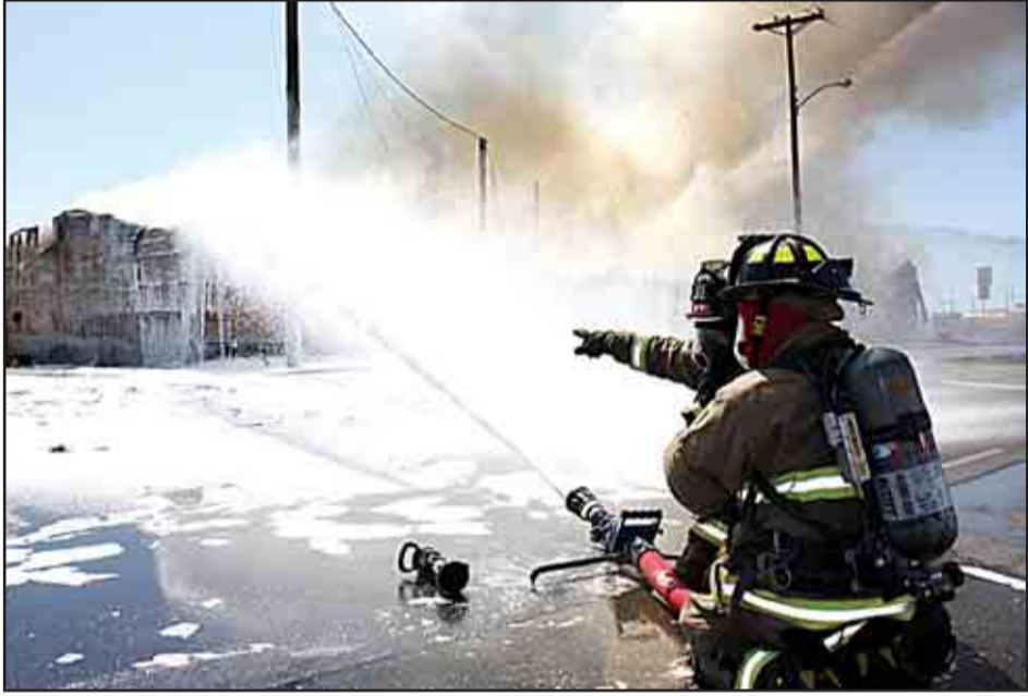
TOP: The former Hobbs grocery warehouse building at Leech and Marland burned to the ground on Friday afternoon. The building was a total loss and there were no injuries.